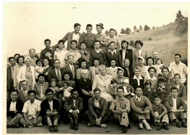
Sensei at Chautauque Park