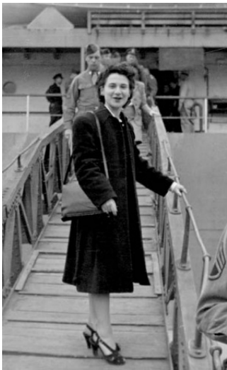
New York Times, January 1, 2013.